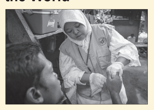
Tuesday evenings, February 11 – March 17 7:00 to 8:30 pm UCSF School of Nursing 513 Parnassus Avenue Room N-225

All around the world, children and adults face illnesses and injuries including trauma, infections, disasters and epidemics, medical emergencies and acute complications of pregnancy. Learn about injury and illness patterns in other parts of the world and how the Global Health faculty of the UCSF Department of Emergency Medicine provide humanitarian relief, develop and implement emergency educational programs in low and middle income countries, and develop policy to improve systems of care through collaboration with the World Health Organization.